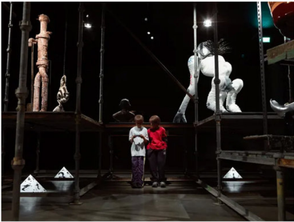
Game Boys is Patricia Piccinini's hyperreal sculpture of two children playing console games (centre).

Mona's O - a portable touchscreen device that serves as the museum's map, information centre, exhibition pamphlet, wall text and more - is integral to the work. AR markers peppered throughout the exhibition allow you to access an extra layer of the installation, such as real ads made by mining and service companies using technology for things like surveillance, monitoring workers' sleep patterns or replacing human workers entirely.